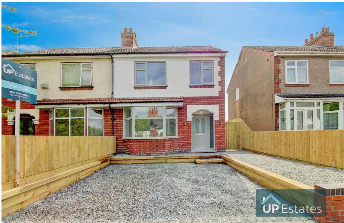
Brandon Road, Binley, Coventry